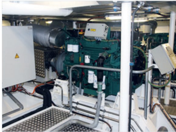
Volvo Penta marine diesel engine.

The double-ended ferry is powered by two identical Volvo Penta marine diesel engines with Schottel azimuth thrusters at each end of the vessel; each with its own engine room. There is full redundancy of the diesel propulsion.