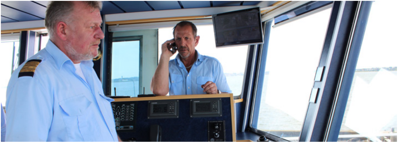
On the bridge