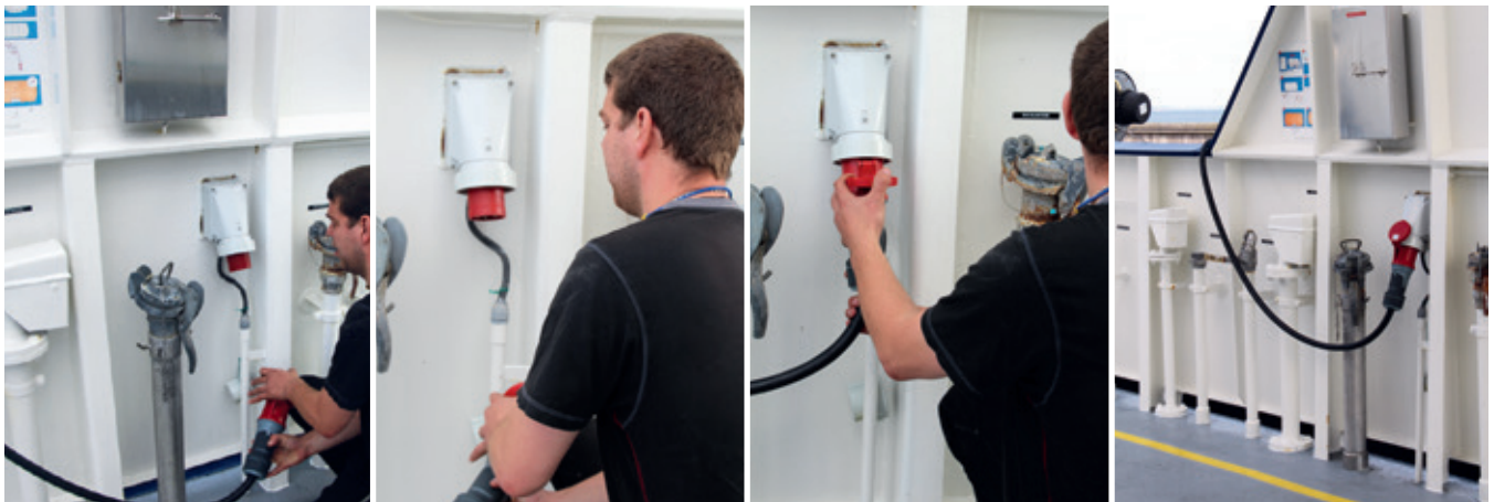
Staff connect to the shore power supply to commence charging the battery bank.

Furthermore, these batteries have a long lifetime of minimum 10 years, at a high volume of charging cycles (1 cycle = fully charged to fully discharged and back to fully charged).